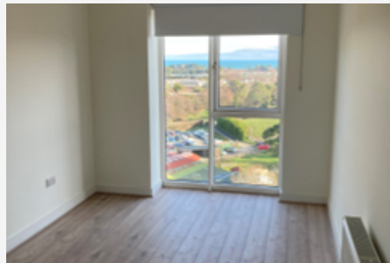
Sample photo of bedroom.