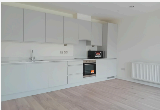
Sample photo of kitchen.

To find out if this Cost Rental Scheme is for you, read the below eligibility requirements and check our website for more information.