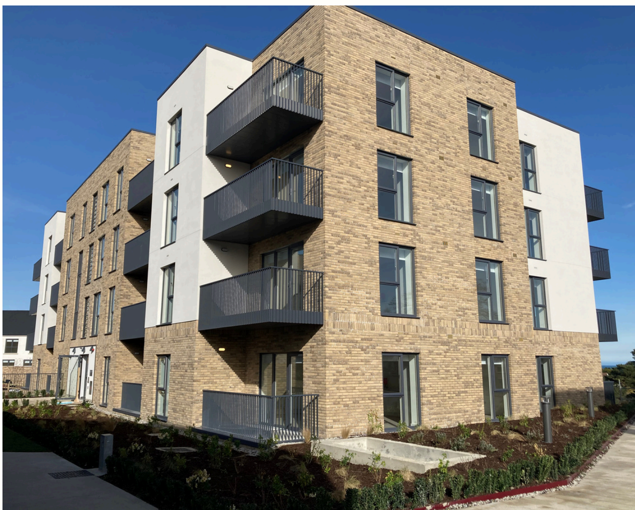
Archers Wood, Delgany, Co. Wicklow