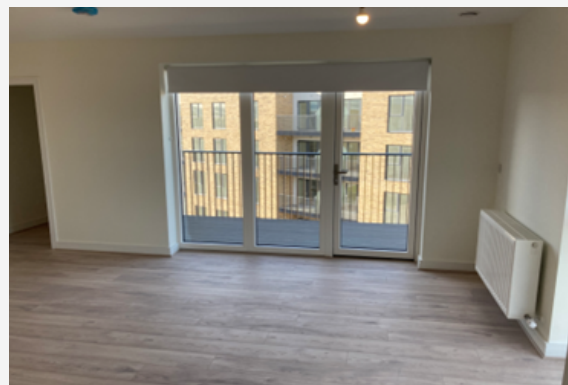
Sample photo of living room.