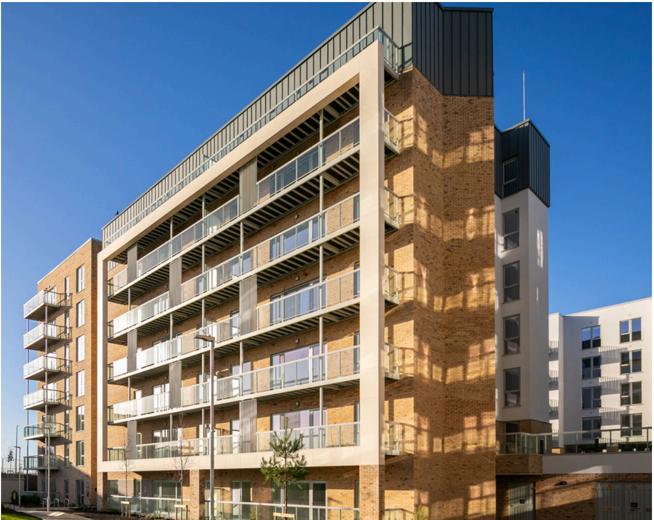
Barnwell Point, Hansfield Dublin 15