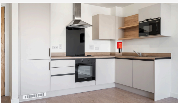
Sample photo of kitchen.

To find out if this Cost Rental Scheme is for you, read the below eligibility requirements and check our website for more information.