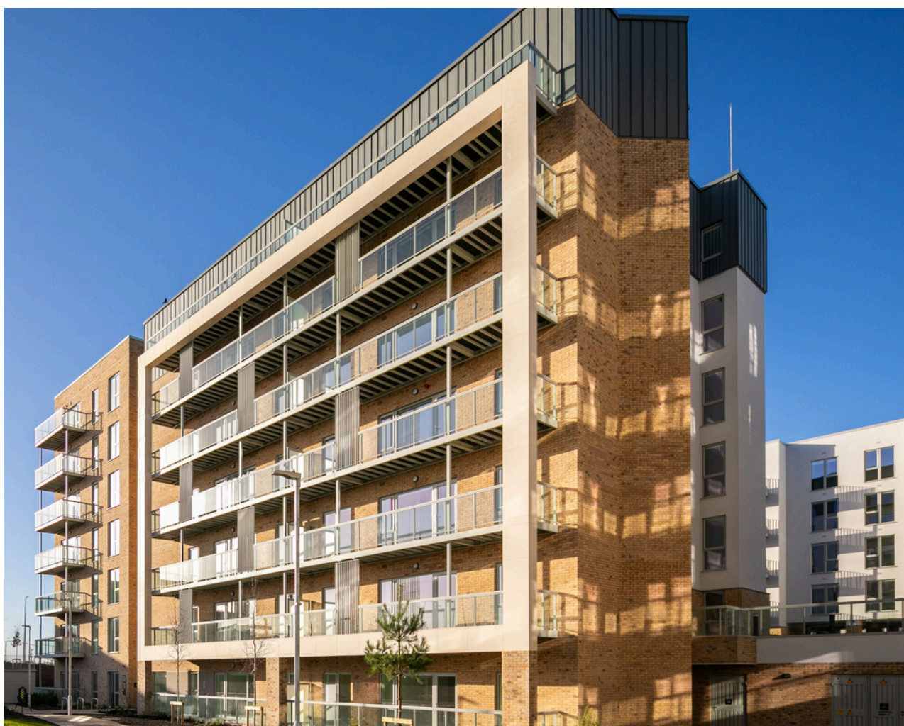
Barnwell Point, Hansfield Dublin 15