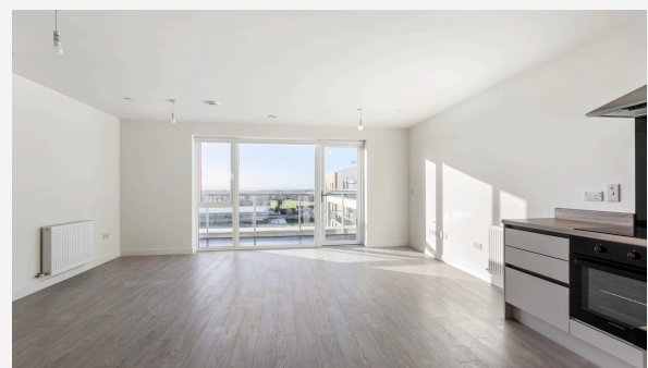
Sample photo of living room.