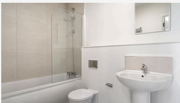
Sample photo of bathroom.