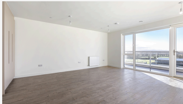
Sample photo of bedroom.