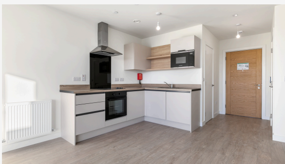
Sample photo of kitchen.

To find out if this Cost Rental Scheme is for you, read the below eligibility requirements and check our website for more information.