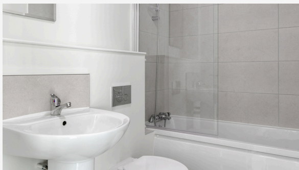
Sample photo of bathroom.