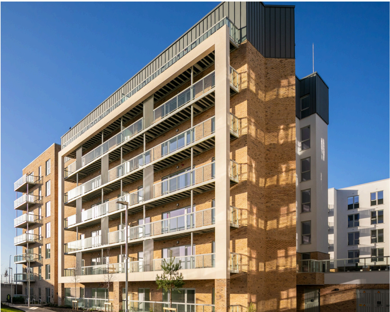
Barnwell Point, Hansfield Dublin 15