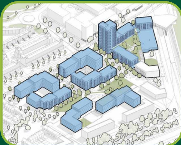
Phase 1 overall site map