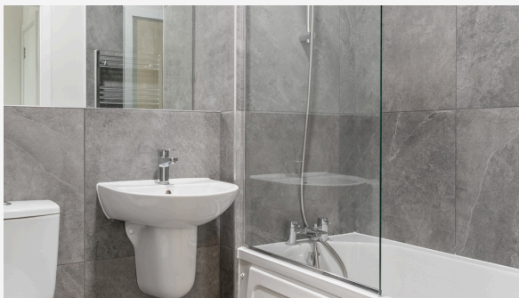
Sample photo of bathroom.