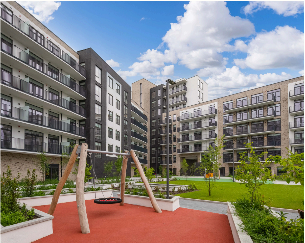
Cookstown Gateway, Dublin 24