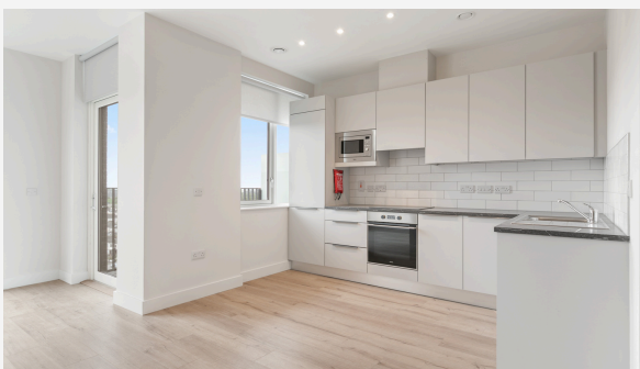
Sample photo of kitchen.

To find out if this Cost Rental Scheme is for you, read the below eligibility requirements and check our website for more information.