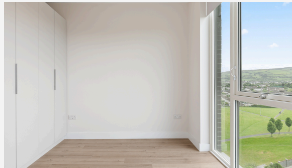
Sample photo of bedroom.