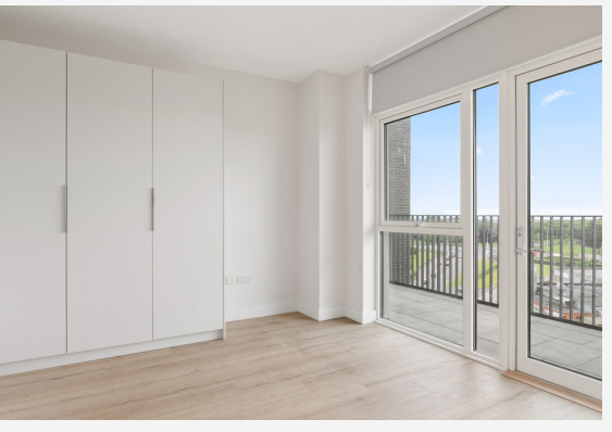
Sample photo of bedroom.