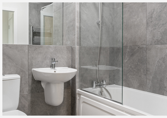
Sample photo of bathroom.