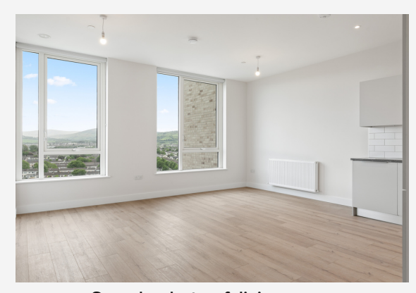
Sample photo of living room.