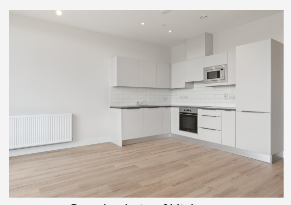
Sample photo of kitchen.

To find out if this Cost Rental Scheme is for you, read the below eligibility requirements and check our <u>website</u> for more information.