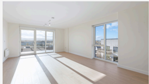
Sample photo of living room.