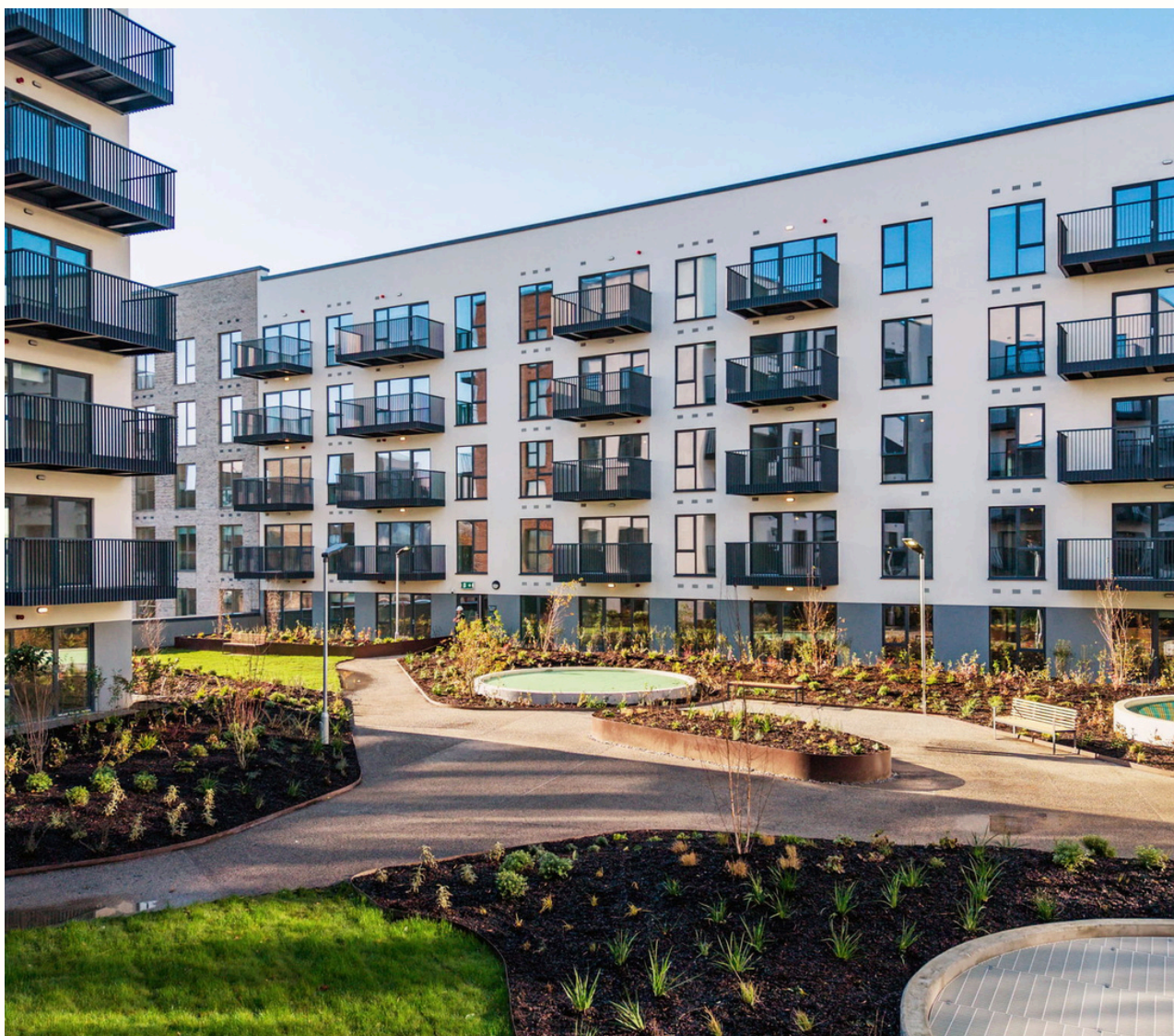
Cooper Square, Seven Mills Dublin 22