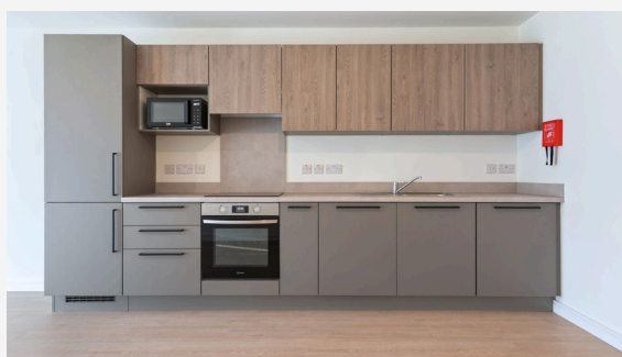
Sample photo of kitchen.

To find out if this Cost Rental Scheme is for you, read the below eligibility requirements and check our website for more information.