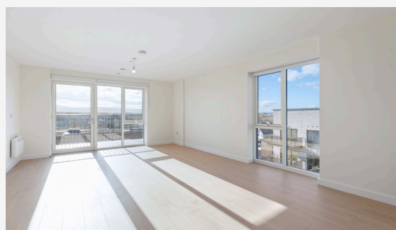
Sample photo of living room.