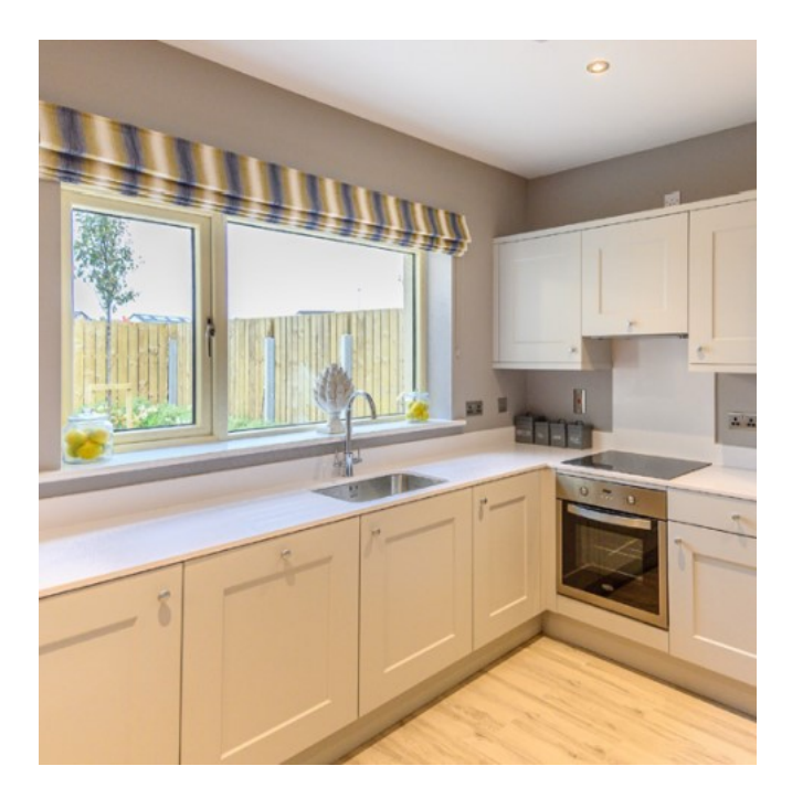
Sample of Kitchen—Actual Finish will Vary