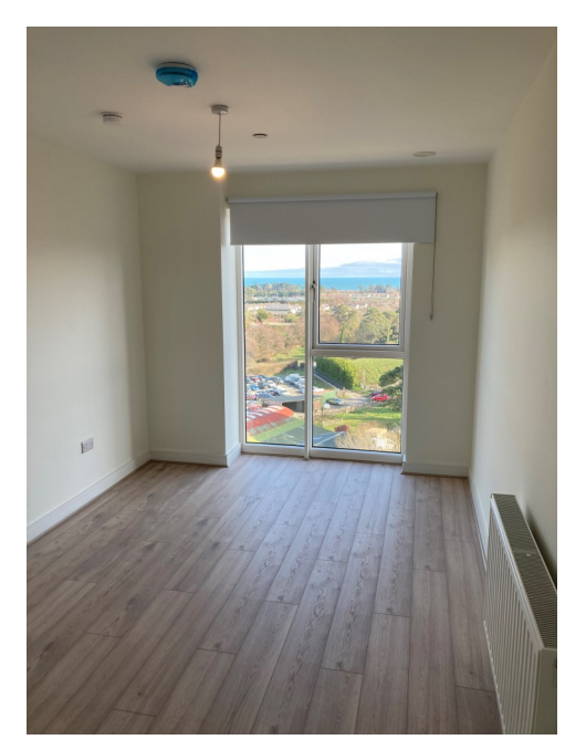
Sample of Bedroom Space