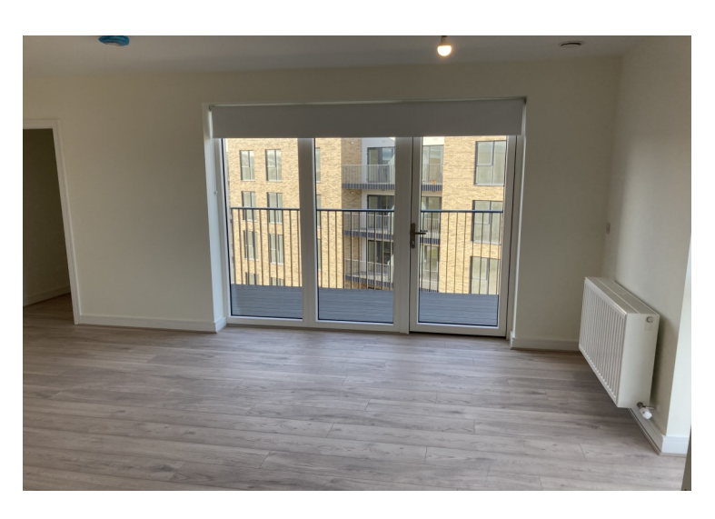
Sample of Living Room Space