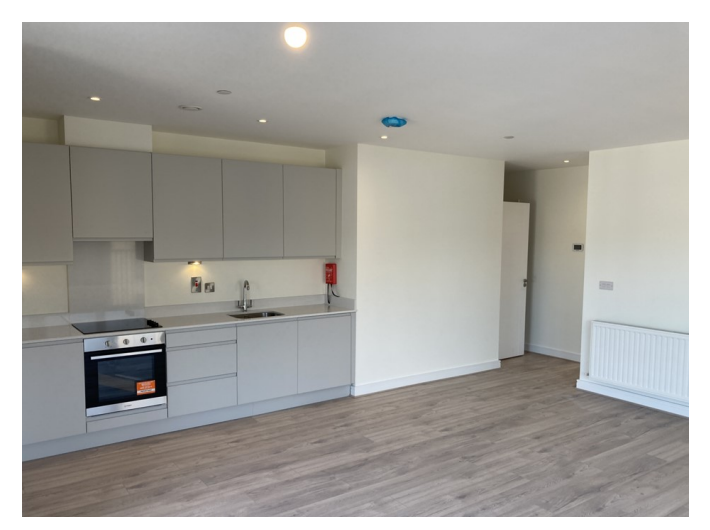
Sample of Kitchenette / Living Room Space