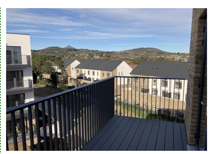
Sample of Balcony View