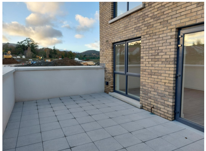
Sample of balcony / patio space