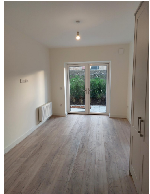
Sample of living room layout