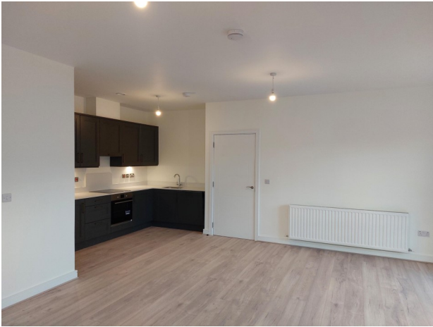
Sample of kitchen living room layout

The LDA are offering two types of homes for rent under this initial Cost rental application process: