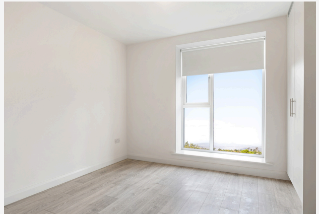
Sample photo of bedroom.