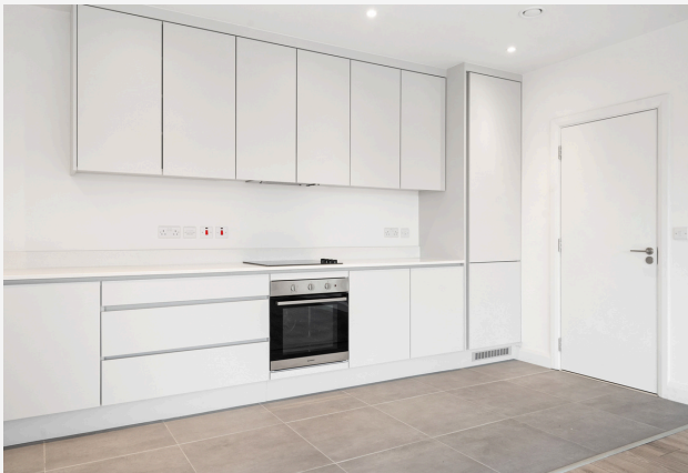
Sample photo of kitchen.

Dun Óir is also within walking distance of the LUAS and its park and ride facility, connecting you to the City in 30 minutes.