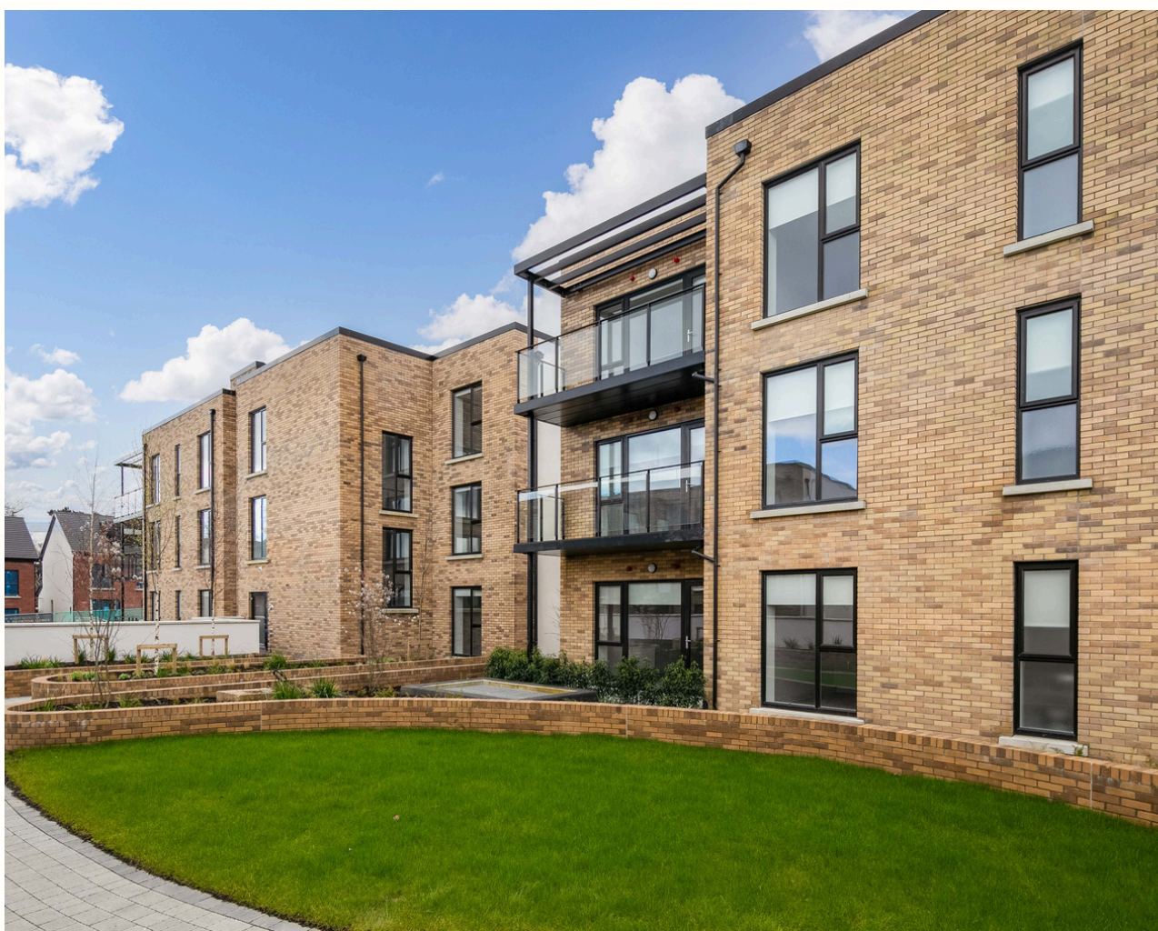
Dun Óir, Kilternan Dublin 18