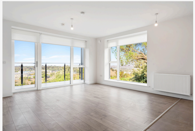
Sample photo of living room.