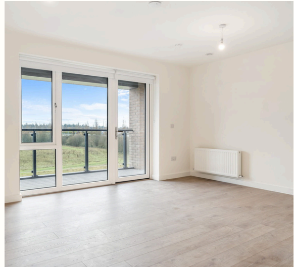
Sample photo of living room.