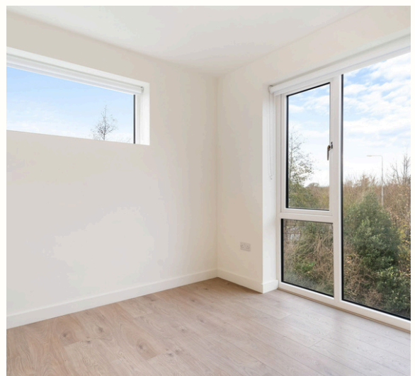
Sample photo of bedroom.