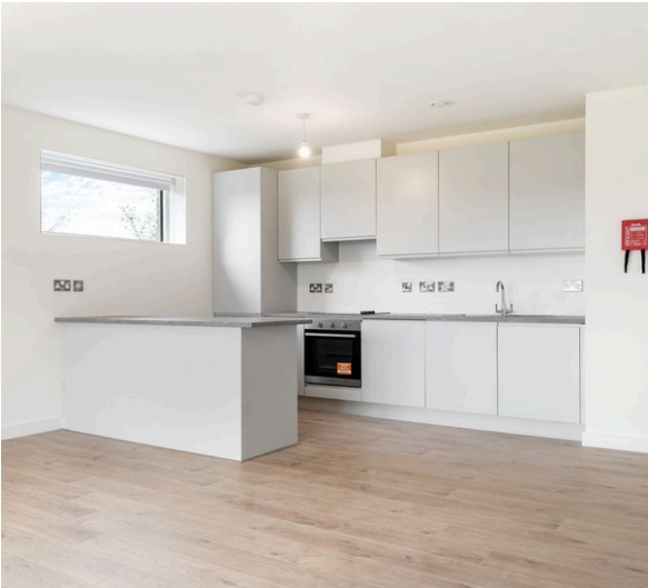
Sample photo of kitchen.