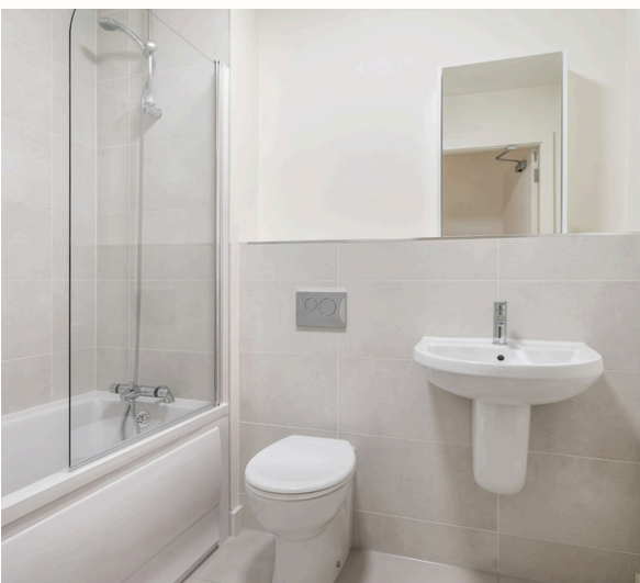
Sample photo of bathroom.