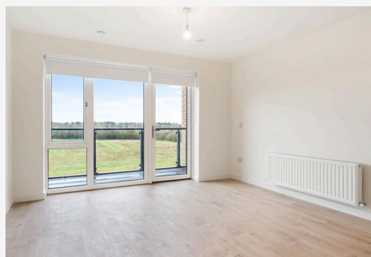
Sample photo of living room.