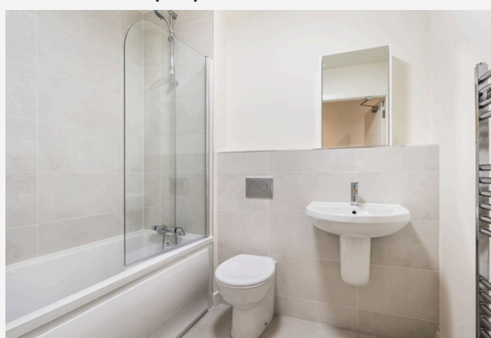
Sample photo of bathroom.