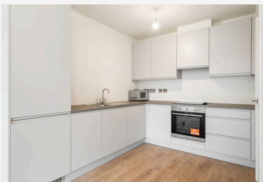
Sample photo of kitchen.

To find out if this Cost Rental Scheme is for you, read the below eligibility requirements and check our website for more information.