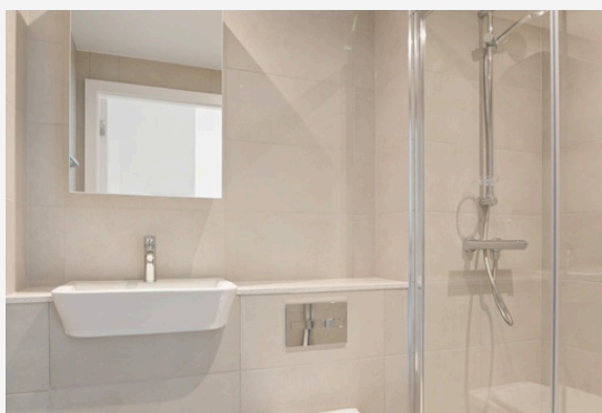
Sample photo of bathroom.