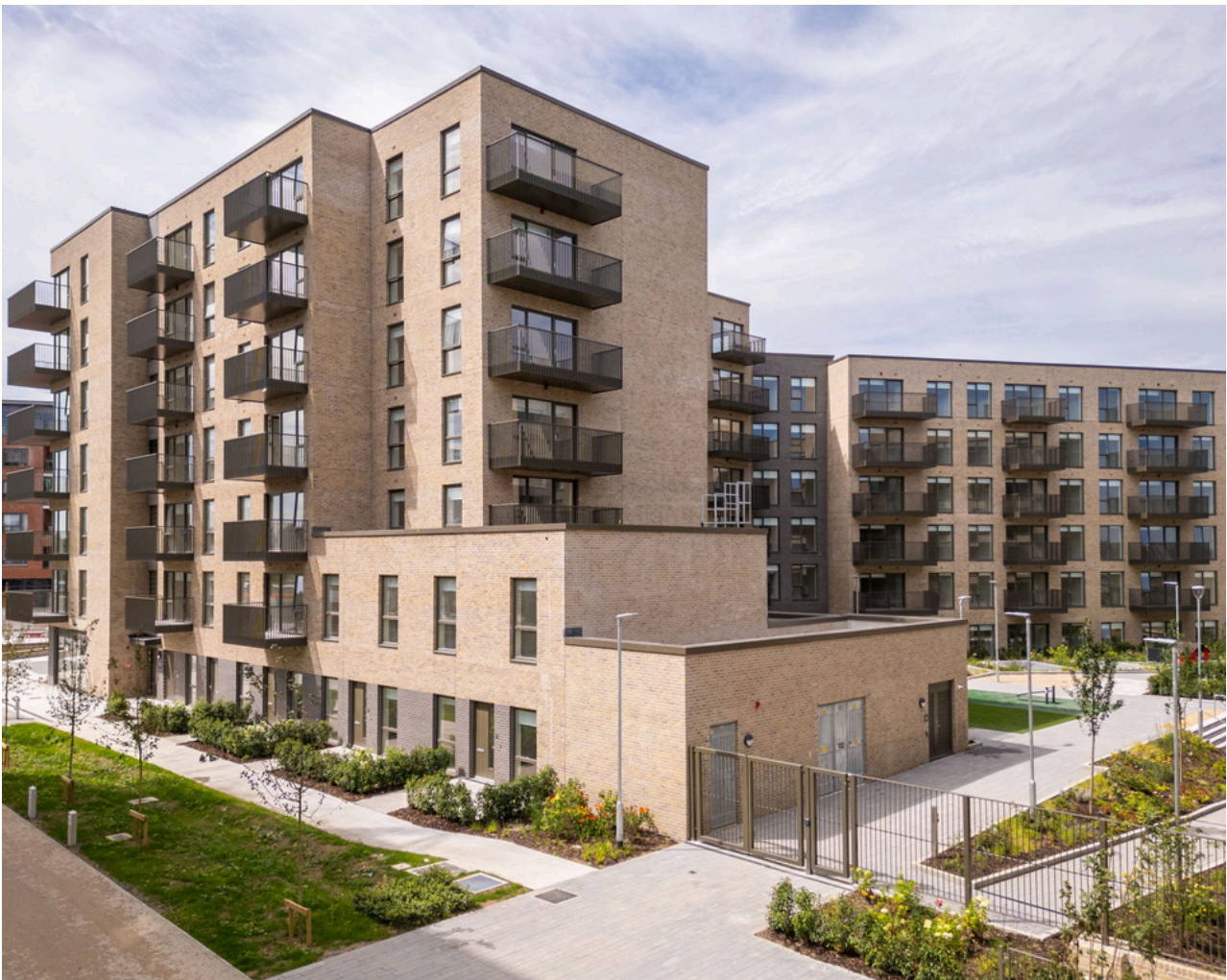
Parkside, Belmayne Dublin 13