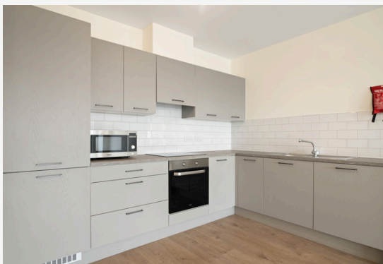
Sample photo of kitchen.

To find out if this Cost Rental Scheme is for you, read the below eligibility requirements and check our website for more information.