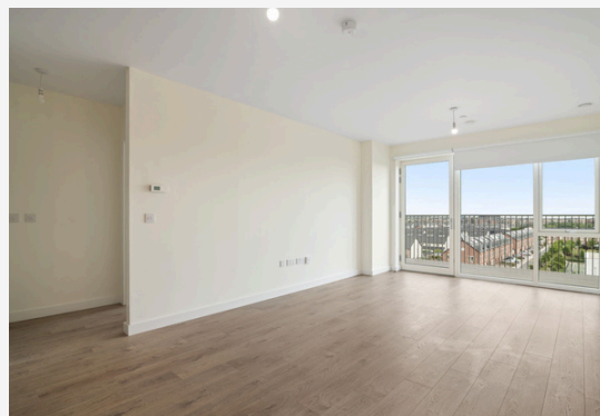
Sample photo of living room.