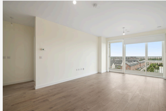
Sample photo of living room.