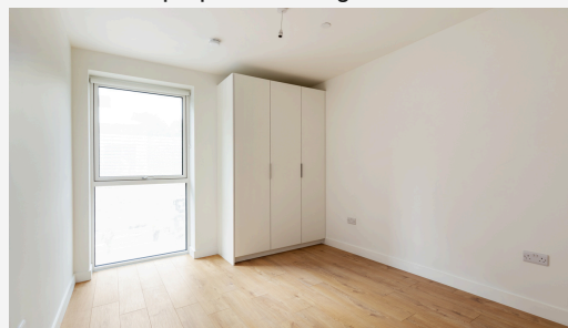
Sample photo of bedroom.