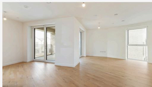
Sample photo of living room.