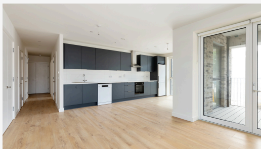
Sample photo of kitchen.

To find out if this Cost Rental Scheme is for you, read the below eligibility requirements and check our website for more information.