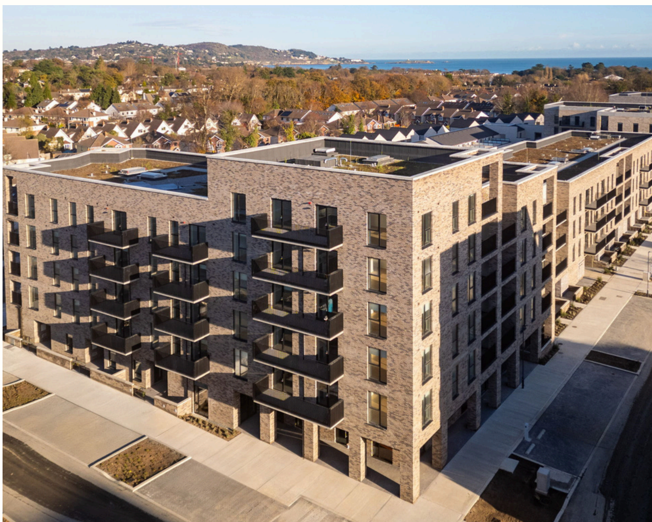
Shanganagh Castle Estate, Shankill, Dublin 18