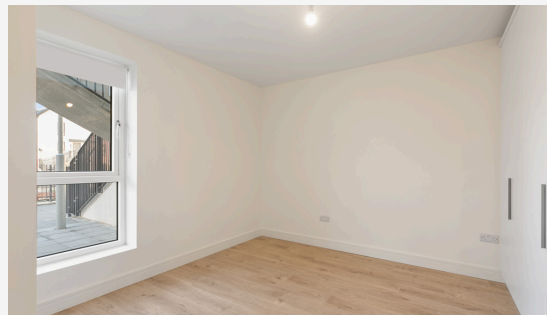
Sample photo of bedroom.