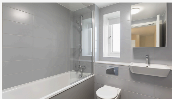
Sample photo of bathroom.