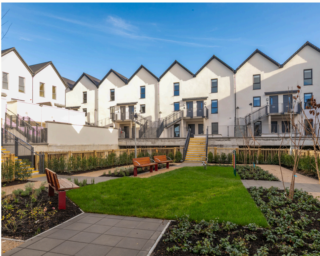
The Mills, Castletroy, Co. Limerick