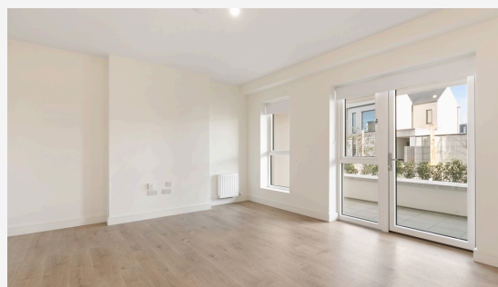
Sample photo of living room.