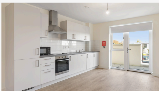
Sample photo of kitchen.

To find out if this Cost Rental Scheme is for you, read the below eligibility requirements and check our website for more information.