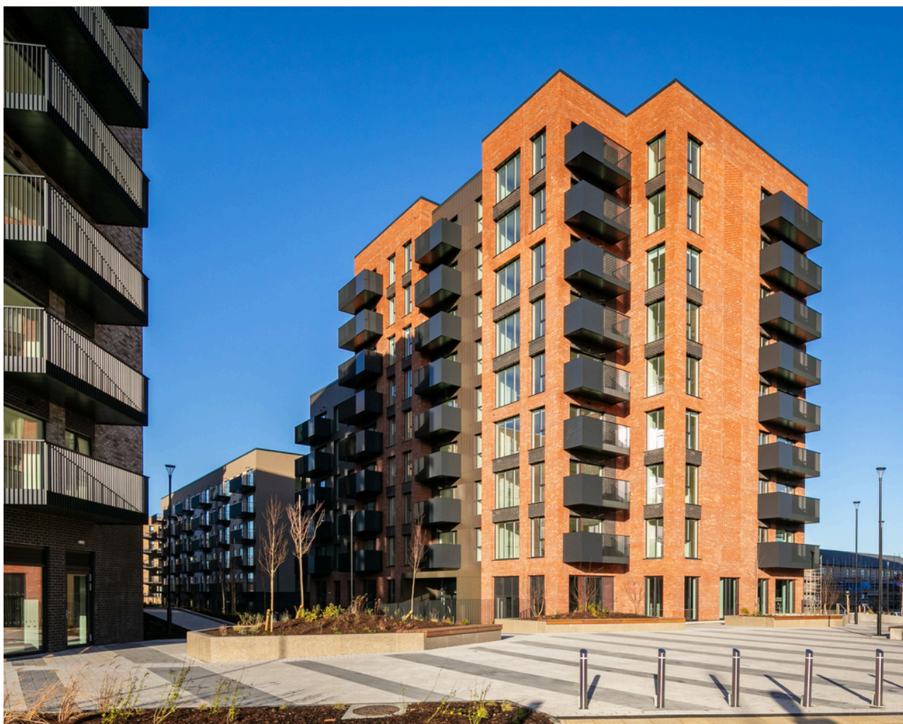
The Quarter, Citywest, Dublin 24