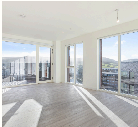
Sample photo of living room.