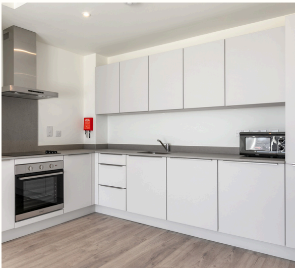
Sample photo of kitchen.