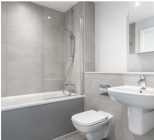
Sample photo of bathroom.