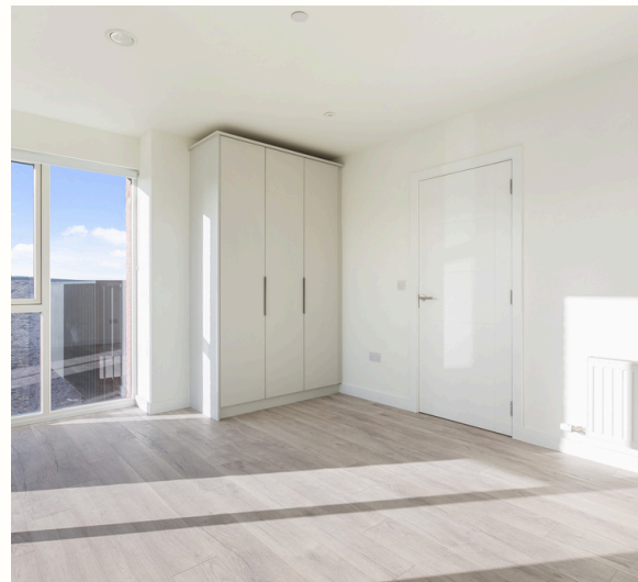
Sample photo of bedroom.