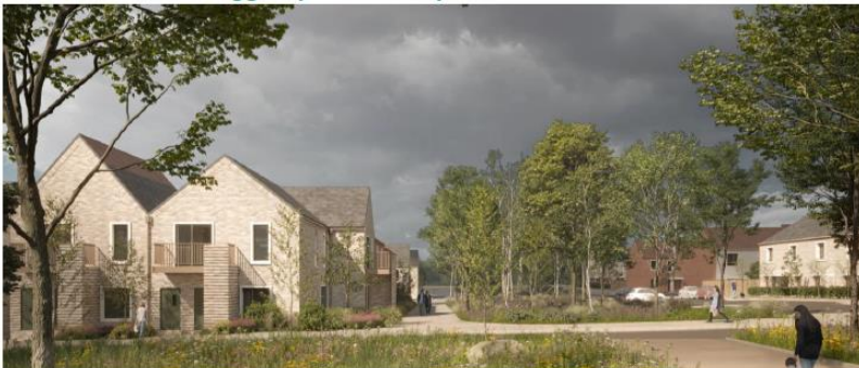
Castlelands, Balbriggan (c.800 units)