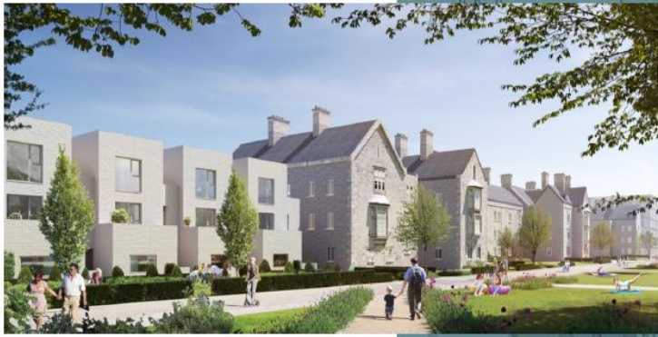
Dundrum Central (c.1000 units)