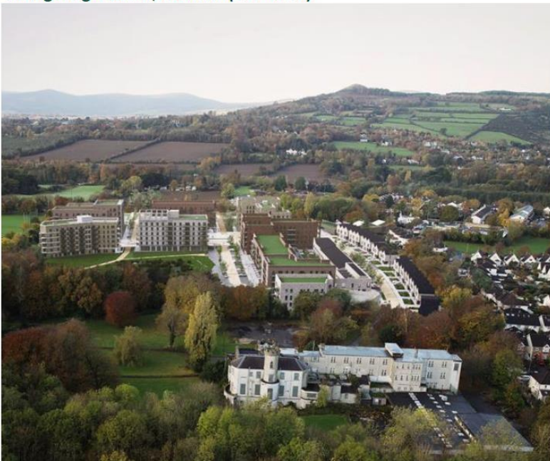
Shanganagh Castle, Shankill (597 units)